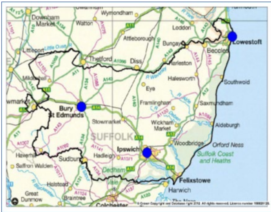
Figure 1 – Map of the County of Suffolk

Note: Principal police stations are marked in blue