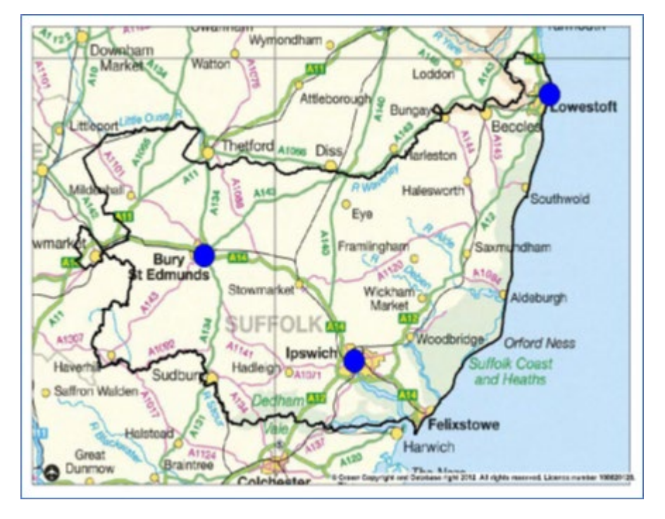
Figure 1 – Map of the County of Suffolk