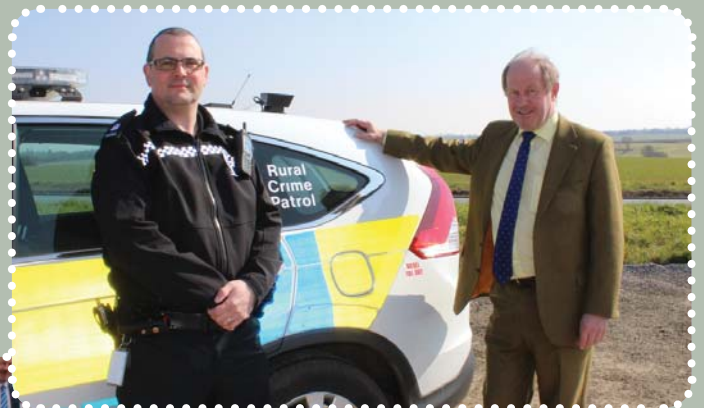
▶ New rural crime team in Mid Suffolk.