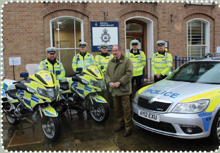
▲ Launch of additional Roads Policing Unit in Bury St Edmunds.