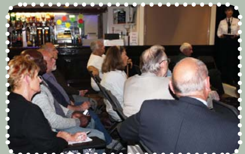
▼ Public consultation event to listen to local views on policing.