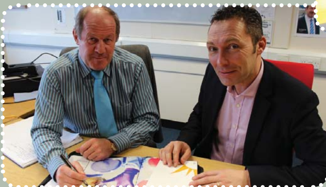
▲ Delighted to be signed up as a Suffolk Business Ambassador.