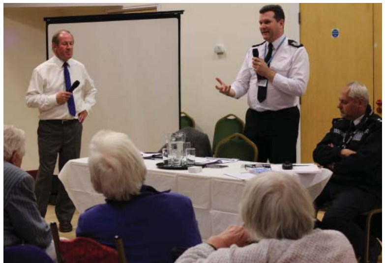
A typical public meeting with the Chief Constable.