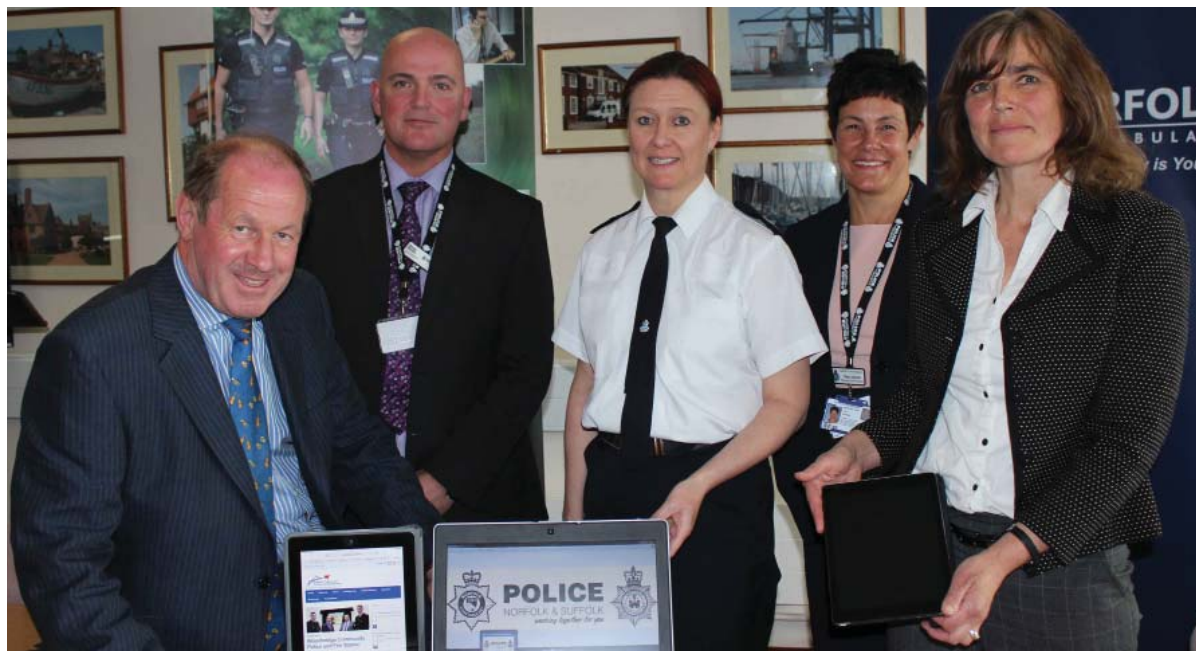
The official launch of the new cyber crime unit in Halesworth in June 2015.

"We now occupy a world where the pace of change is unprecedented and in order to keep our communities safe the Constabulary must adapt quickly to the policing challenges."