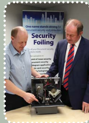
◀ Awarded East Anglian Daily Times Business Award for Crime Prevention.