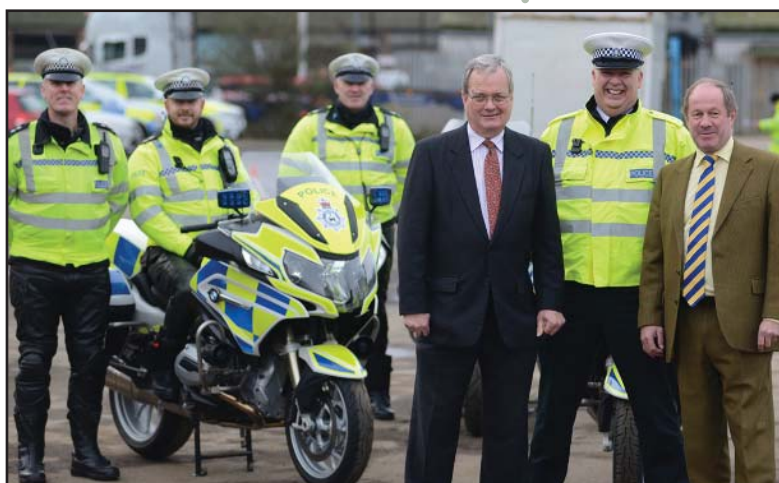
Out with the joint Roads Policing Unit at an operation in Felixstowe.

I am open to further collaborative and partnership approaches with all partners, whether public, private or voluntary, where there is clear evidence that it is in the best interests of the people of Suffolk.